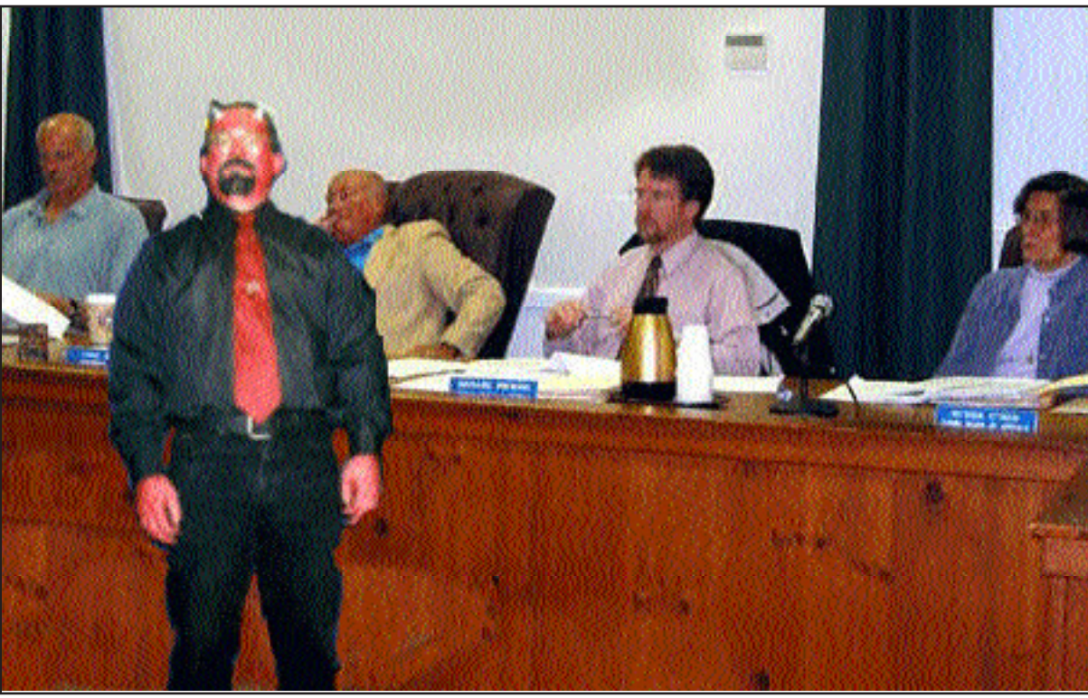
Satan tells the crowd at Tuesday's meeting of the Zoning Board of Appeals that maggots will devour their flesh. The zoning board called such talk "inappropriate."

According to documents submitted with his variance request, Satan plans to build a 40 x 40 guest bedroom on the first floor, adjoining the parlor and the room with hooks from the ceiling. Plumbing fixtures would be added so that a 10 x 15 guest bathroom could also be built. The walls would drip blood.