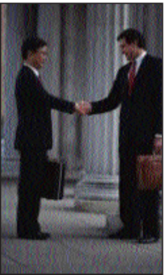
Republicans (above) congratulate each other on having the best candidates.