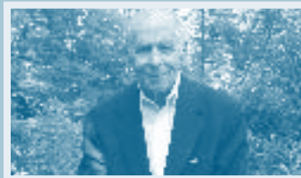
Thomas Szasz, MD